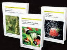
Food and Nutritional Components in Focus