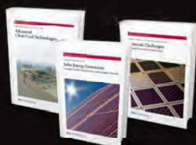
RSC Energy & Environment Series