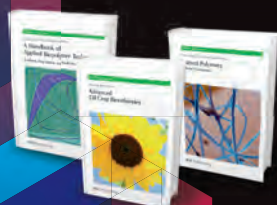
RSC Green Chemistry Series