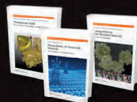
RSC Nanoscience & Nanotechnology Series