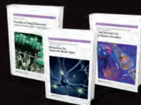
RSC Drug Discovery Series