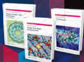
RSC Biomolecular Sciences Series